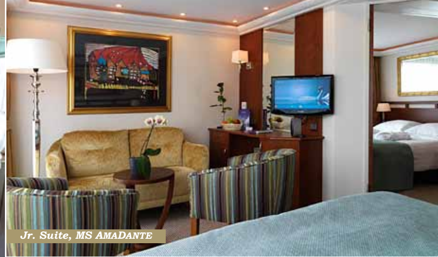
Jr. Suite, MS AMADANTE