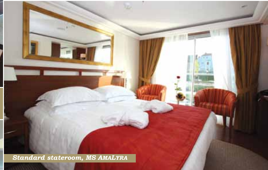
Standard stateroom, MS AMALYRA