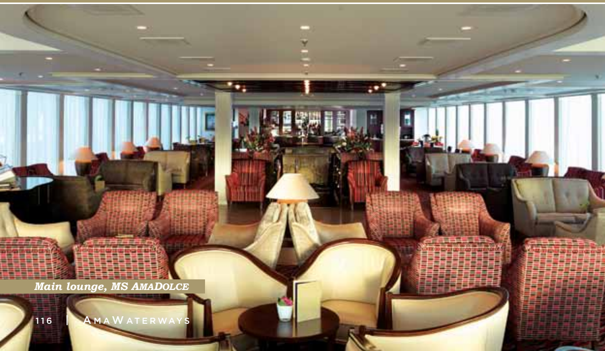
Main lounge, MS AMADOLCE