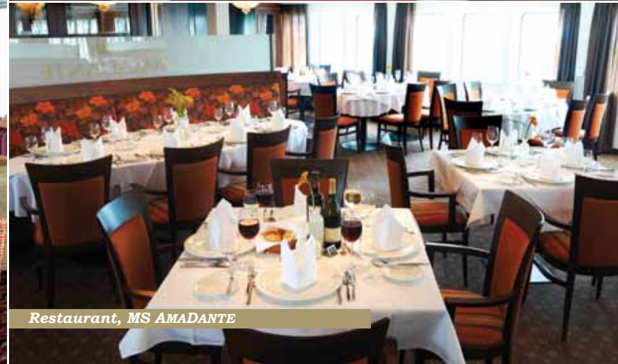
Restaurant, MS AMADANTE