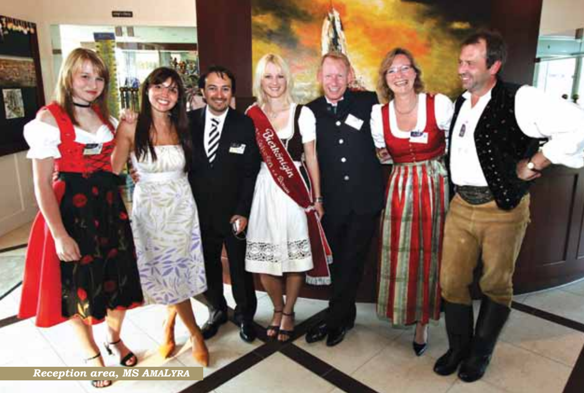
Reception area, MS AMALYRA